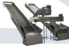
WITHERED LEAF FEEDER