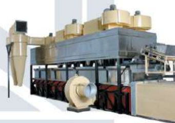
DUAL PURPOSE VIBRO BED DRYER