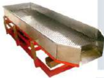
GREEN LEAF SHIFTER