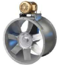
VANE AXIAL FLOW FAN