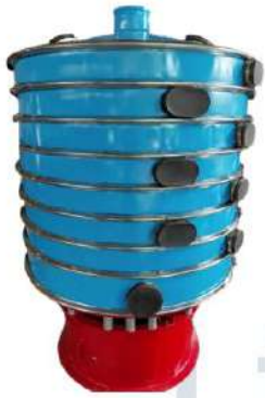
VIBRO SCREEN SORTER