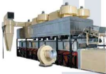
VIBRO FLUID BED DRYER