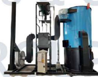
COAL / WOOD HEATER