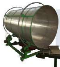
ROTARY BLANK GHOOGIE SHIFTER