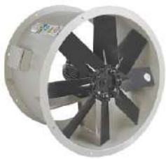
AXIAL FLOW FAN