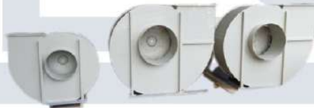
CENTRIFUGAL FLOW FAN