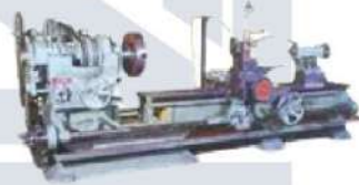
GENERAL PURPOSE CUM CHASING LATHE