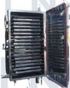
TRAY CIRCUIT DRYER