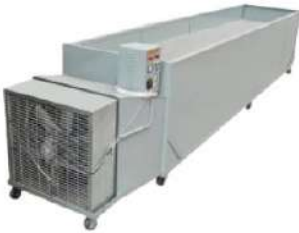
WITHERING THROUGH PANEL