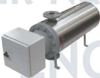
OIL PRE HEATER UNIT