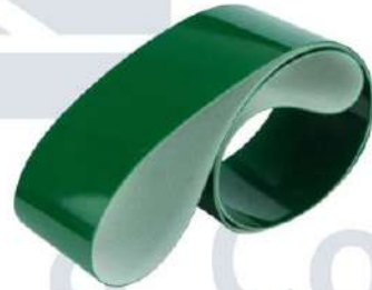
PVC BELT FERMENTOR