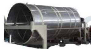
ROTARY PERFORATED LEAF SHIFTER