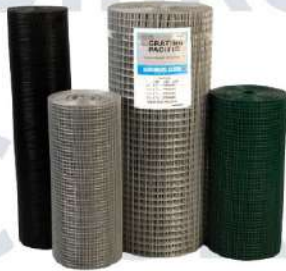
HDPE WOVEN MESH