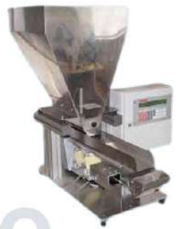
AUTO BATCH WEIGHER