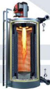
D.F OIL/GAS HEATER