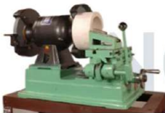
CUTTER CHASER GRINDER